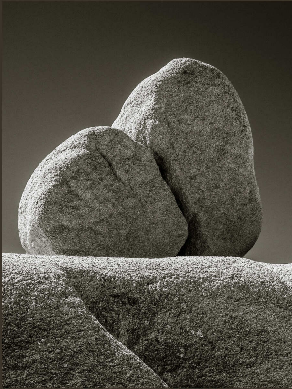
Stone Couple, Skull Rock Trail