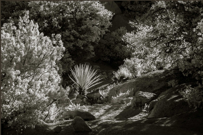
Spring Oasis, Jumbo Rocks Trail