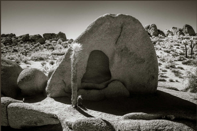
Desert Abode, Joshua Tree NP