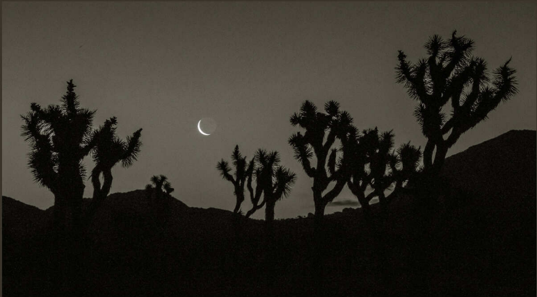
New Moon Waning, Joshua Tree NP