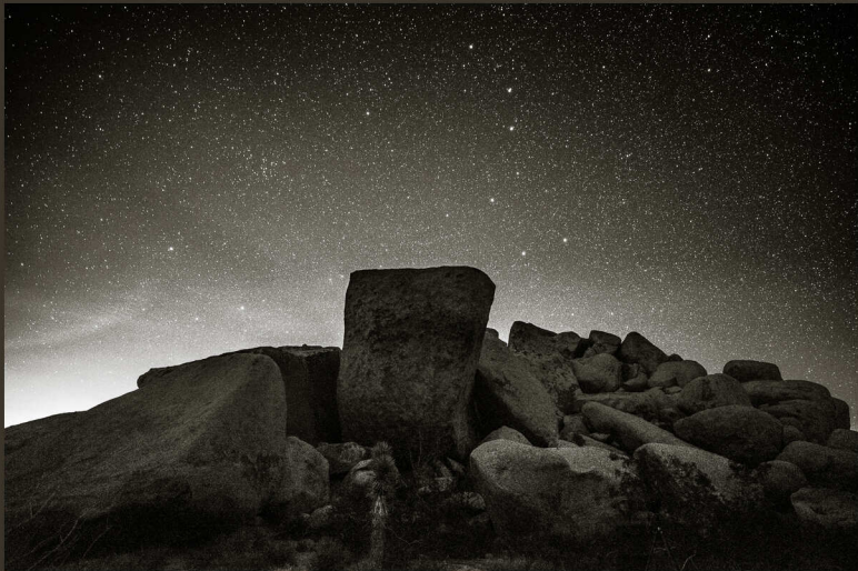
Stone Monument & Big Dipper, Joshua Tree NP