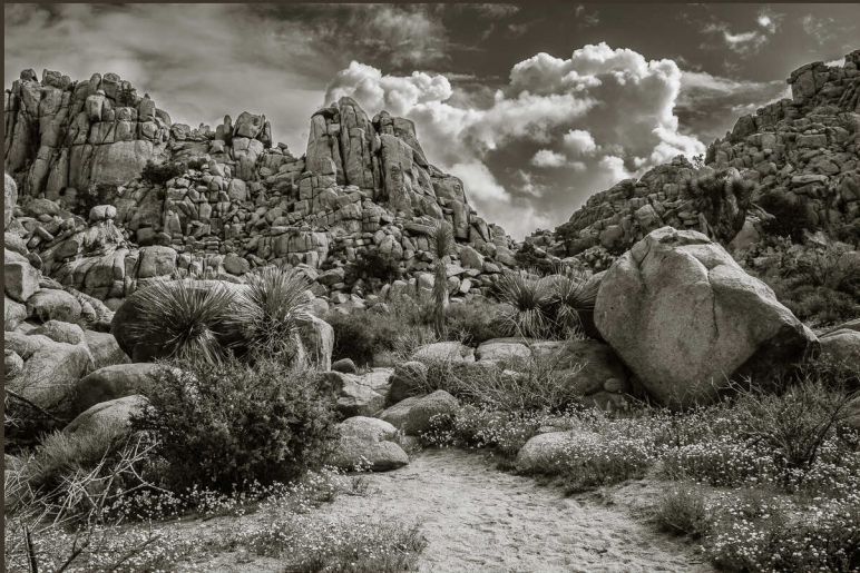
Spring Morning, Lost Horse Wall, Joshua Tree NP