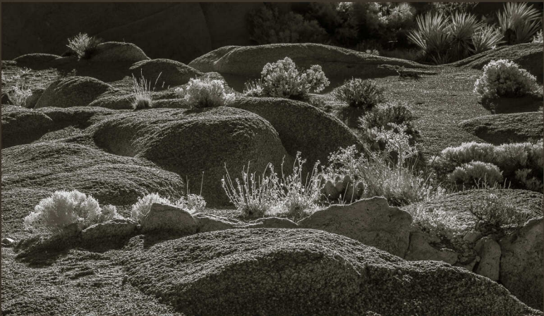
Rock Garden, Joshua Tree NP