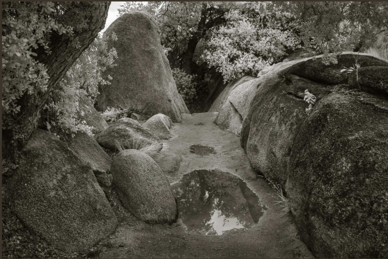
Trail to Barker Dam