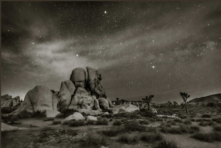
Guardian, Hidden Valley, Joshua Tree NP