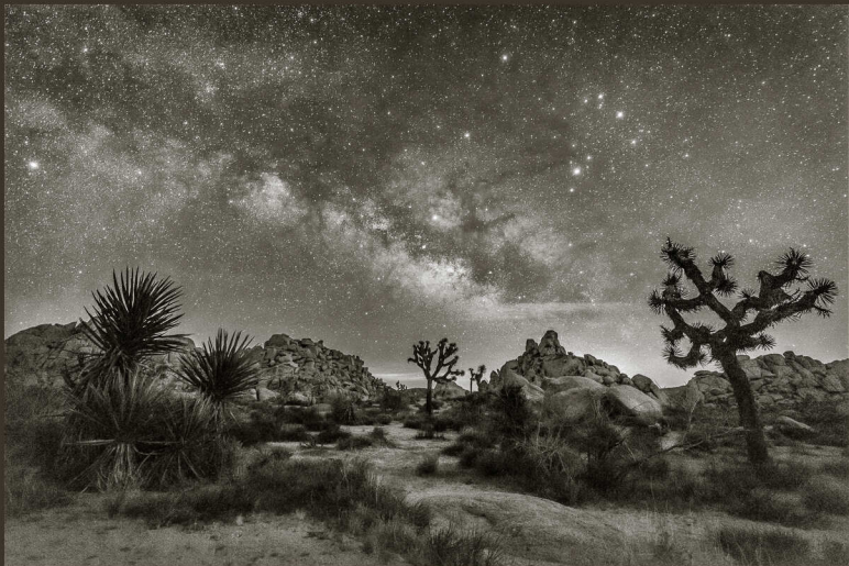
Yuccas and Stars, Joshua Tree N.P.