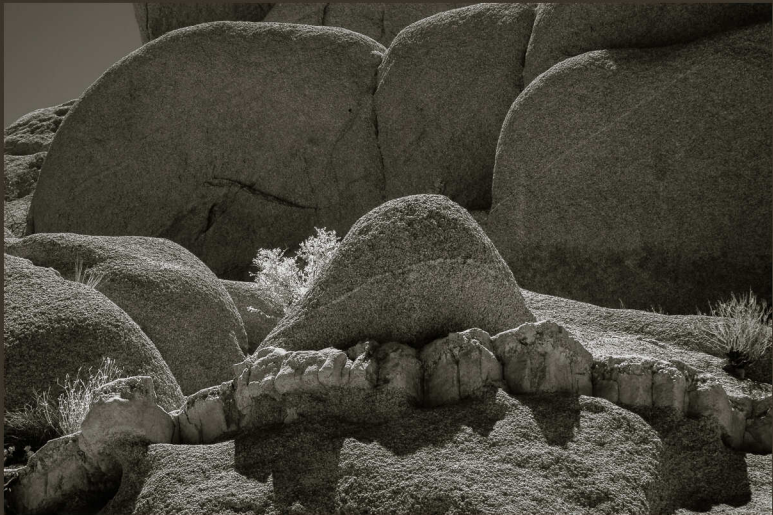
Monzogranite Shrine, Jumbo Rocks Trail