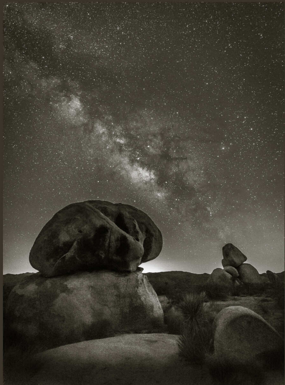
Star Beacon, Joshua Tree NP